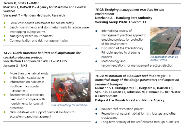
Figure 1. Example for paper digest

For each paper a paper digest will be included in the Final Programme of the conference. This will be published by CEDA's official magazine, Dredging and Port Construction and will be circulated to the whole readership worldwide. Figure 1 shows how the paper digest will look like.